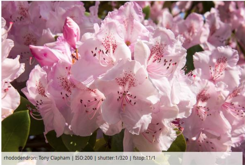
rhododendron: Tony Clapham | ISO:200 | shutter:1/320 | fstop:11/1